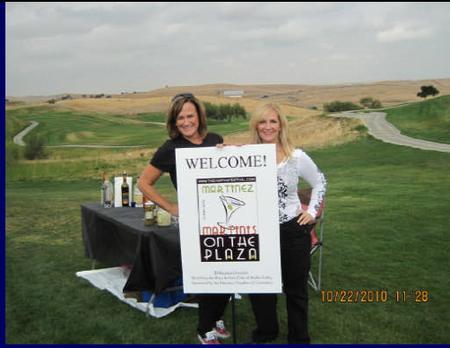
Martinez Mayor's Cup 2010 10/22/2010 11:28