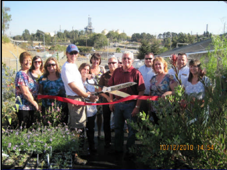
Garden Natives Ribbon Cutting - Oct 10/12/2010 14:54